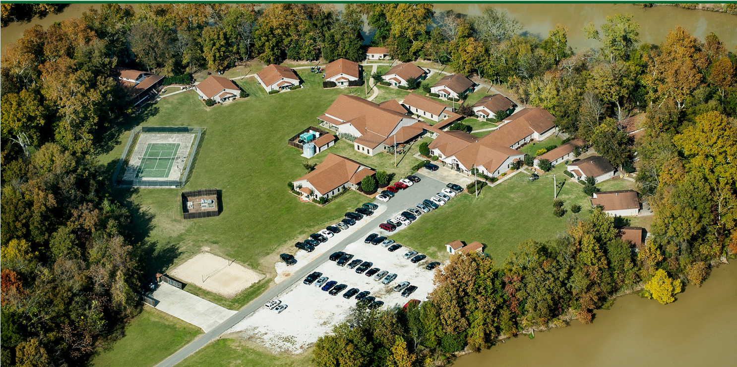
Our secluded 70-acre campus is surrounded by beautiful Lake Lafourche.

Palmetto Addiction Recovery Center • 86 Palmetto Road, Rayville, LA 71269 Ph: 1-800-203-6612 • Fax 318-728-2272 • www.palmettocenter.com • e-mail: info@palmettocenter.com